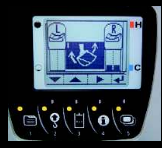
MAX. AUX Oil Flow Setting (SP1 and SP2)